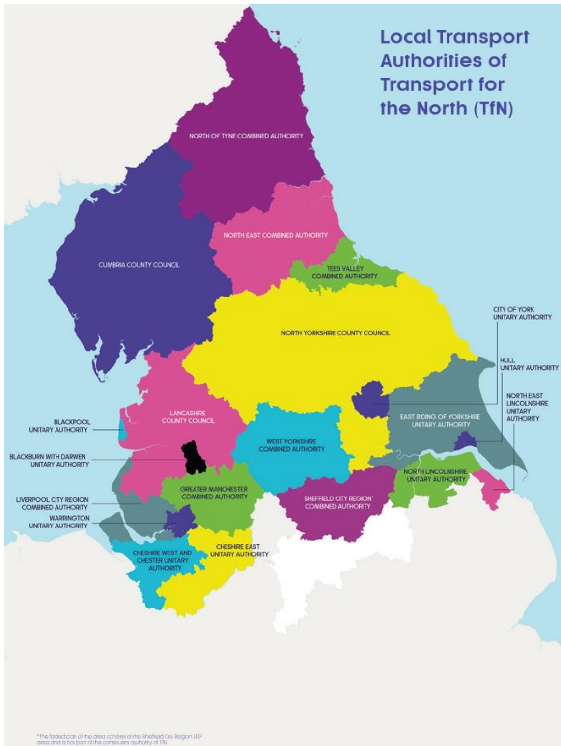
Figure 1: TfN Geography (to be updated, for final publication, to reflect local authority boundaries for Westmoreland and Furness Council and Cumberland Council)